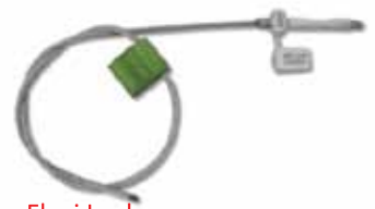
Mega Flexi Lock