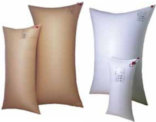
Paper Dunnage Air Bags Woven PP Dunnage Air Bags