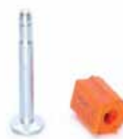
Container Bolt Lock